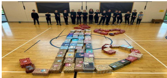
Our Annual Shoebox Appeal