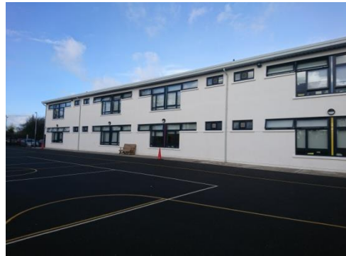
Our New School Building opened in September 2018.

The scheme is covered by Allianz Insurance. Details and registration are offered through the school in September.