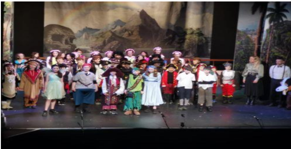
Peter Pan 2022

We look forward to working with and your child in their time in Kildalkey N.S. Should you have any further questions or queries, please contact the school for further information.