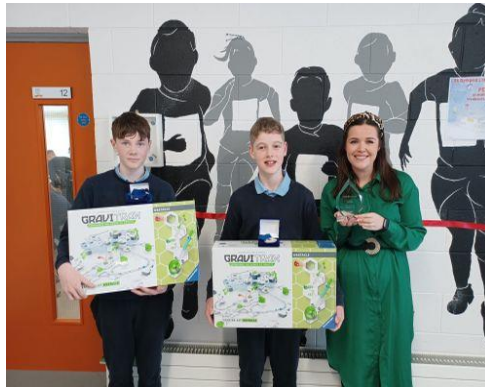
Mini Scientist Runners Up 2022

Each year the children in 4 th , 5 th and 6 th class participate in the Intel Mini Scientist Competition. Taking part in the Intel Mini Scientist involves creating a science and / or technology project which can be based on the Primary Science Curriculum covering topics such as Living Things, Energy and Forces, Materials and Environmental Awareness and Care, or any area which is of interest to the participating students. Our school has strong tradition and track record in this area; we participate in Science STEAM and Maths Week each year.