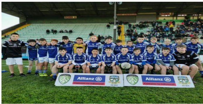
Cumann na mBunscol Div 2 Champions 2022